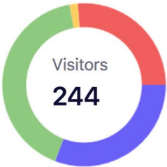
Top traffic sources